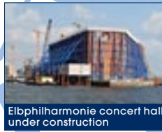
Elbphilharmonie concert hall under construction